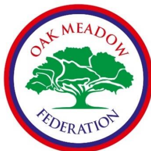
Oak Meadow Federation